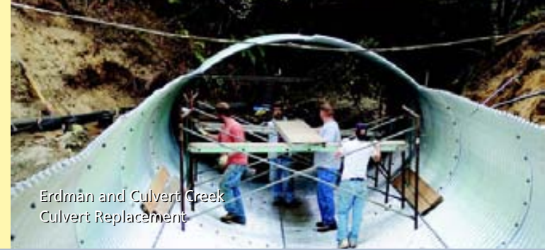
Erdman and Culvert Creek Culvert Replacement