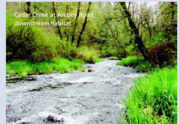
Cedar Creek at Amboy Road downstream habitat.