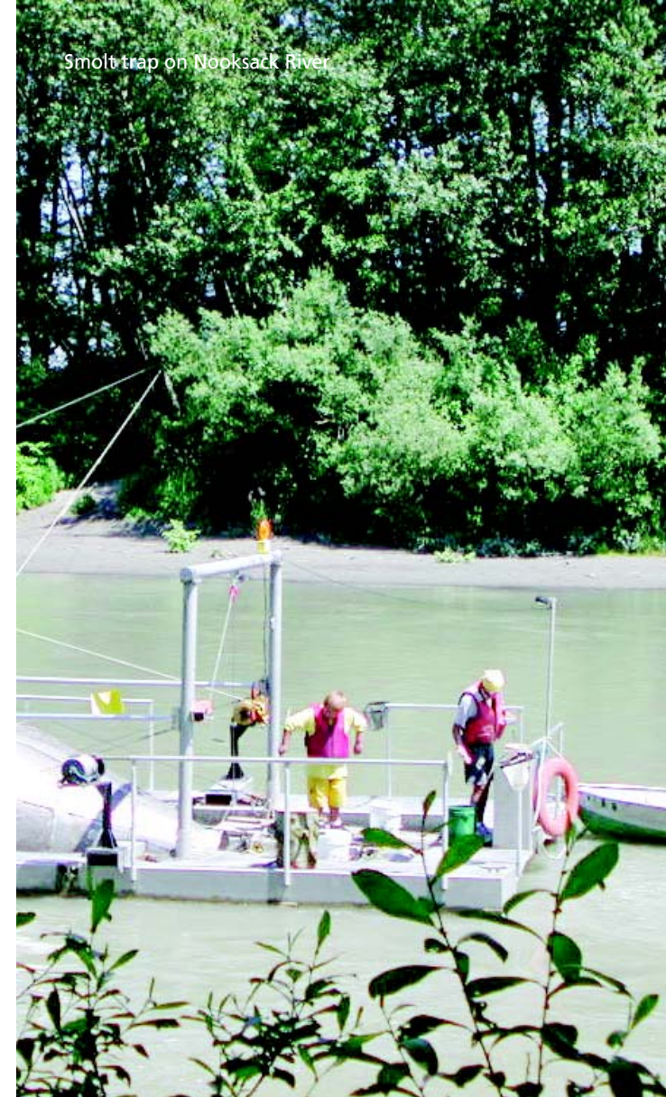
Smolt trap on Nooksack River

Those stocks having the greatest amount of information tend to be the strongest and largest, where historical commercial and sport fisheries have required detailed information to meet allocation requirements under various federal court rulings.