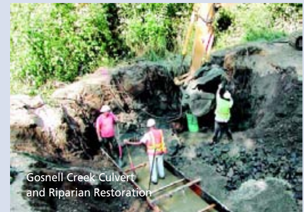
Gosnell Creek Culvert and Riparian Restoration